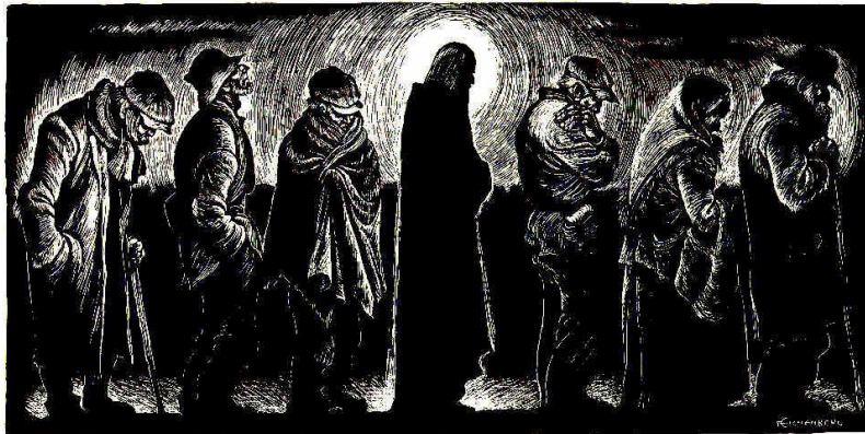
Christ of the Breadlines Fritz Eichenberg, 1952

Carry the flame of peace and love, until we meet again. Carry the flame of peace and love, until we meet again.