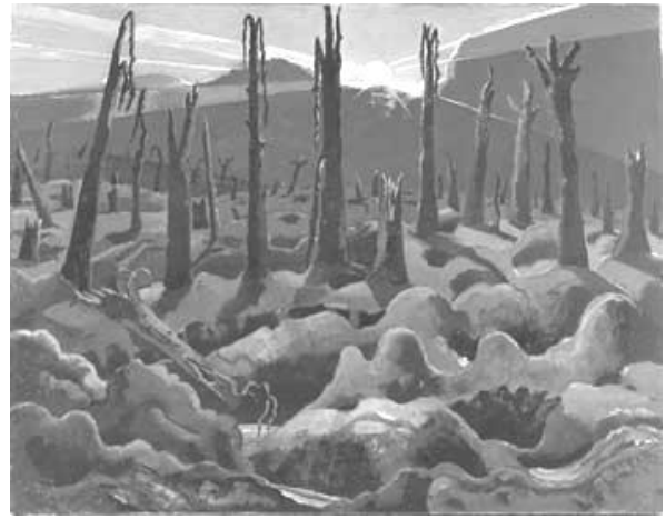
(left) The Battle John Brack (right) We are Making a New World Paul Nash